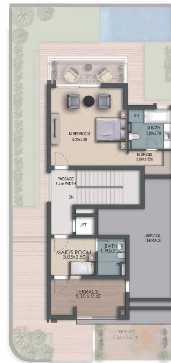
A1 MIDDLE UNIT