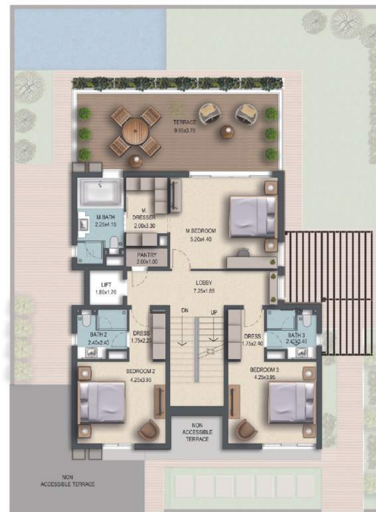
A2 TYPE - FIRST FLOOR PLAN