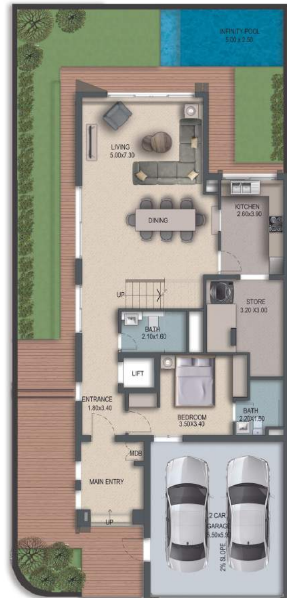
A1 END UNIT GROUND FLOOR PLAN