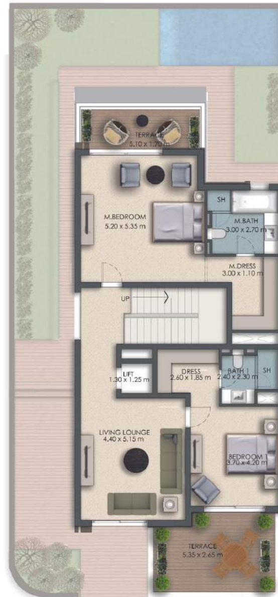
A1 END UNIT FIRST FLOOR PLAN