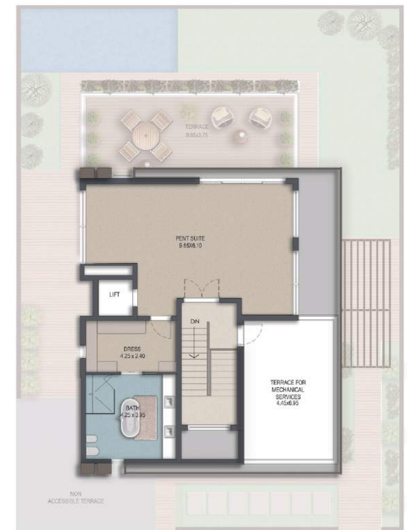
A2 TYPE - SECOND FLOOR PLAN