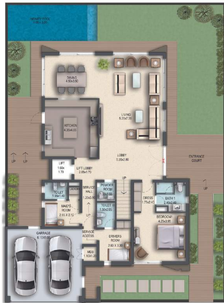
A2 TYPE - GROUND FLOOR PLAN